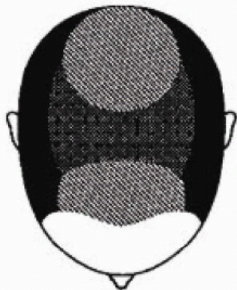
Male Pattern (Hamilton)