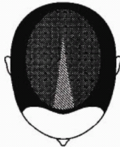
Frontal Accentuation (Olsen)