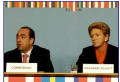
Markos Kyprianou European Commissioner in charge of Health & Consumer Protection

and entitlements" when moving from one EU Member State to another. By and large, Health Min-